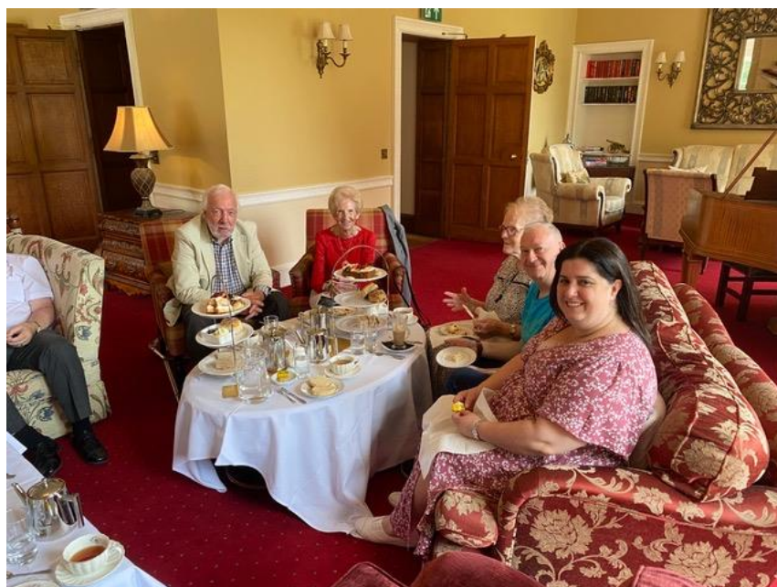
Afternoon Tea at Carberry Towers