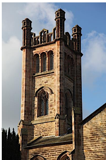
Cockpen & Carrington