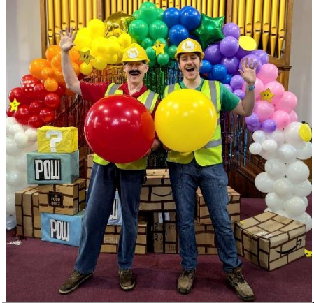
Mario and Luigi leading Holiday Club 2024

In February, we ran our 4 th annual Holiday Club for the primary school children in Bonnyrigg, Lasswade and Rosewell. It was a huge success and a great chance to bring the gospel message to young people in the area whilst also showing them the love which God has for them first hand through the games and crafts we were providing. It was so wonderful to see so many returning kids as well as new kids coming along to experience the love which the church and Jesus wish to show them, and we look forward to building deeper relationships with all the families involved. A huge thank you to all our volunteer and YF helpers during the Holiday Club as they made the week possible. It was a joy to see God's Kingdom coming together!