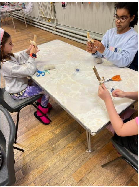
Brownies busy making Crosses for War Graves