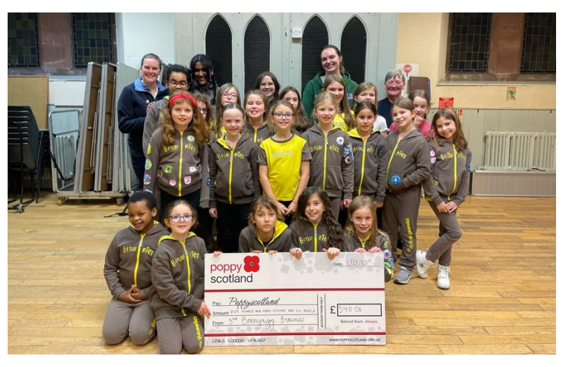
3rd Bonnyrigg Brownies with cheque for Poppy Scotland