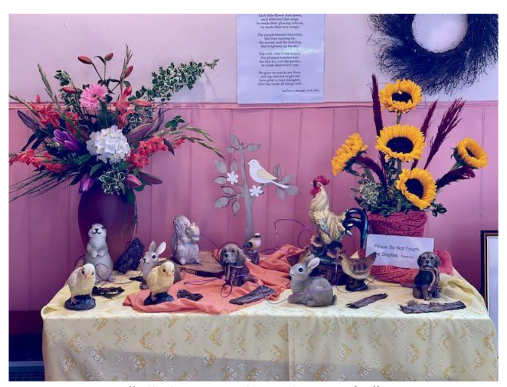
"All Things Bright and Beautiful"