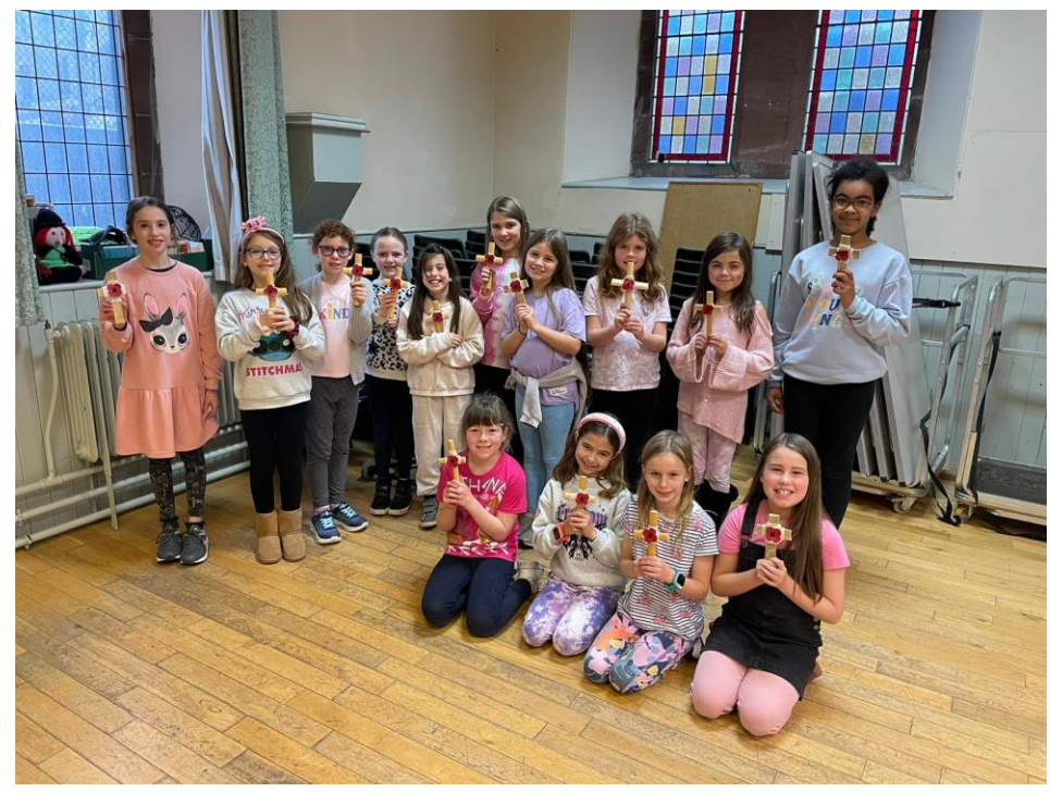
Crosses made for War Graves by the Brownies

Thank you and well done to all the Brownies.