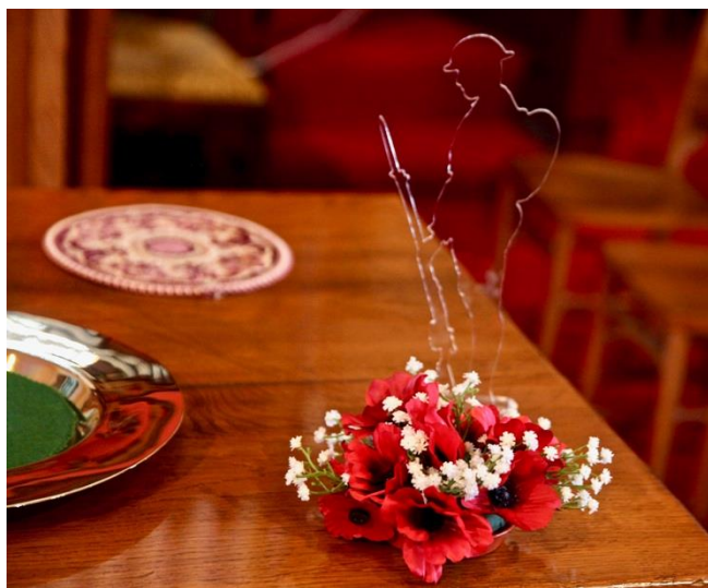
Poppy fall, Cockpen & Carrington Church