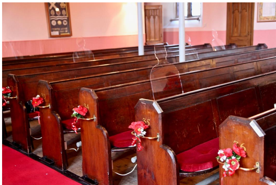
Silhouettes, part of the 'There but not there' project