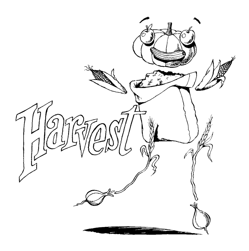
Church of Scotland