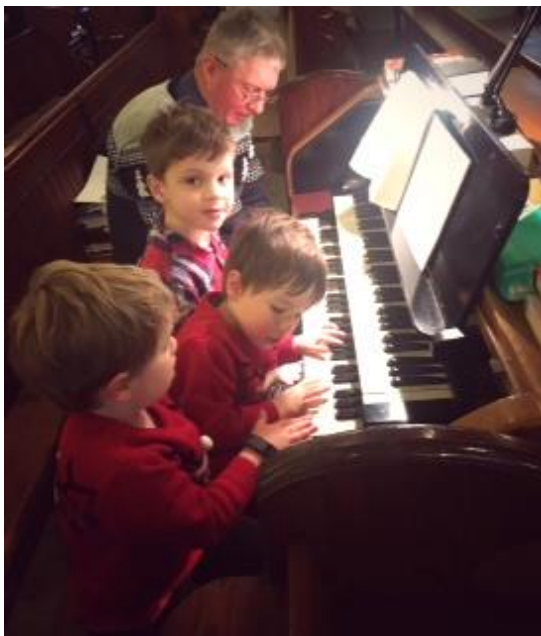
Visiting organists at Lasswade Church on Christmas Day.